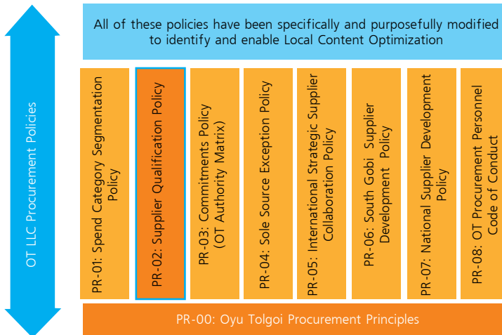
FIGURE 1: Core policies governing OT Procurement

As outlined in Figure 1, the Supplier Qualification Policy is one of eight core policies directing OT's procurement practices.